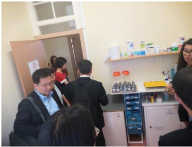
Field visit to Residencia Social S. Joao de Deus, Lisbon-Sintra

emergency housing (Residencia Social S. Joao de Deus) which aims to provide for urgent response regarding transitional and temporary housing for citizens in a situation of social emergency, in cases of extreme vulnerability and lack of protection was organised.