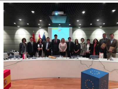
At the Ministry of Labour, Migration and Social Security, Spain

In addition, a field visit to Visit to the Centre of Social Emergency Housing. Social