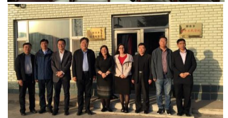
Above meetings at the Civil Affairs Office Da'An county - under the leadership of Deputy Mayor and Deputy Director General of Civil Affairs Jilin province