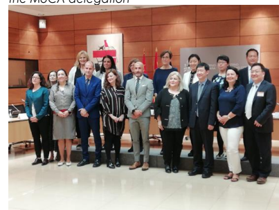
At the Ministry of Health, Consumption and Social Welfare, Spain