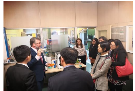
Field visit to the Institute for Older Persons and Social Services, Madrid