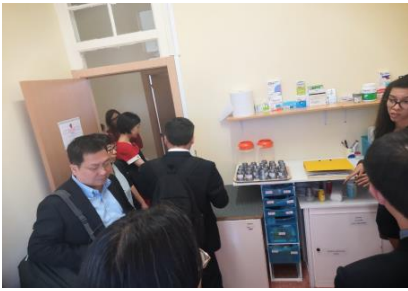
实地考察 São João de Deus 居住处，里斯本- 辛特拉