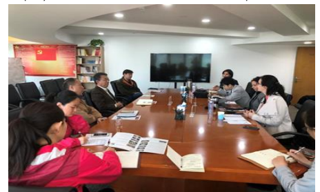
Meeting at the Center of Verification and Identification for Low-income Families of Ministry of Civil Affairs P.R.China