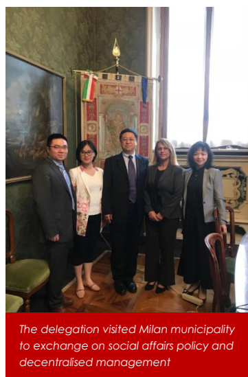
The delegation visited Milan municipality to exchange on social affairs policy and decentralised management