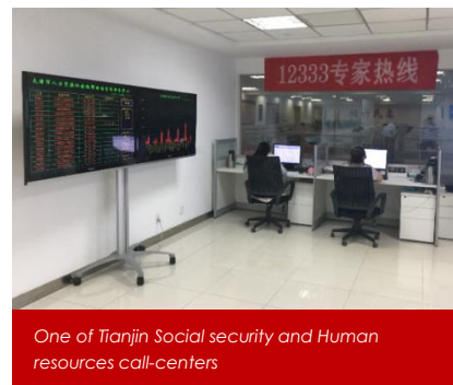
One of Tianjin Social security and Human resources call-centers

contributions under Chinese social security system and the need to increase awareness among workers and employers on the interest to join in the scheme. Participants then submitted their views and suggestions to NDRC leadership on the most urgent issues for social security reform at the decentralised level. On the second day of the event, participants visited Human resources and Social security administrative centers in Tianjin, where they could get better acquainted with qualitative progress made in servicing the public.