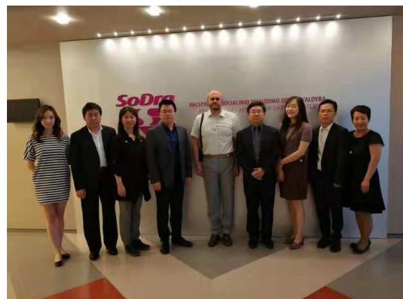
Lithuania – National social security fund

The EU-China SPRP is conducted with the assistance of the European Union. However, this newsletter can in no way be taken as reflecting the views of the European Union.