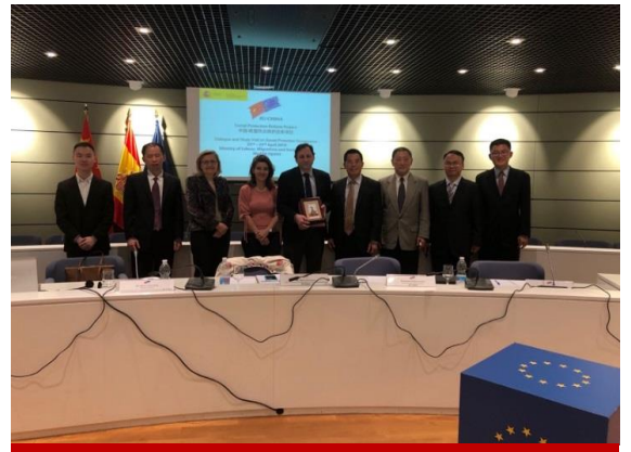
The delegation visiting the Spanish Ministry