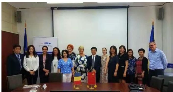
Romania – Ministry of Labour and Social Justice